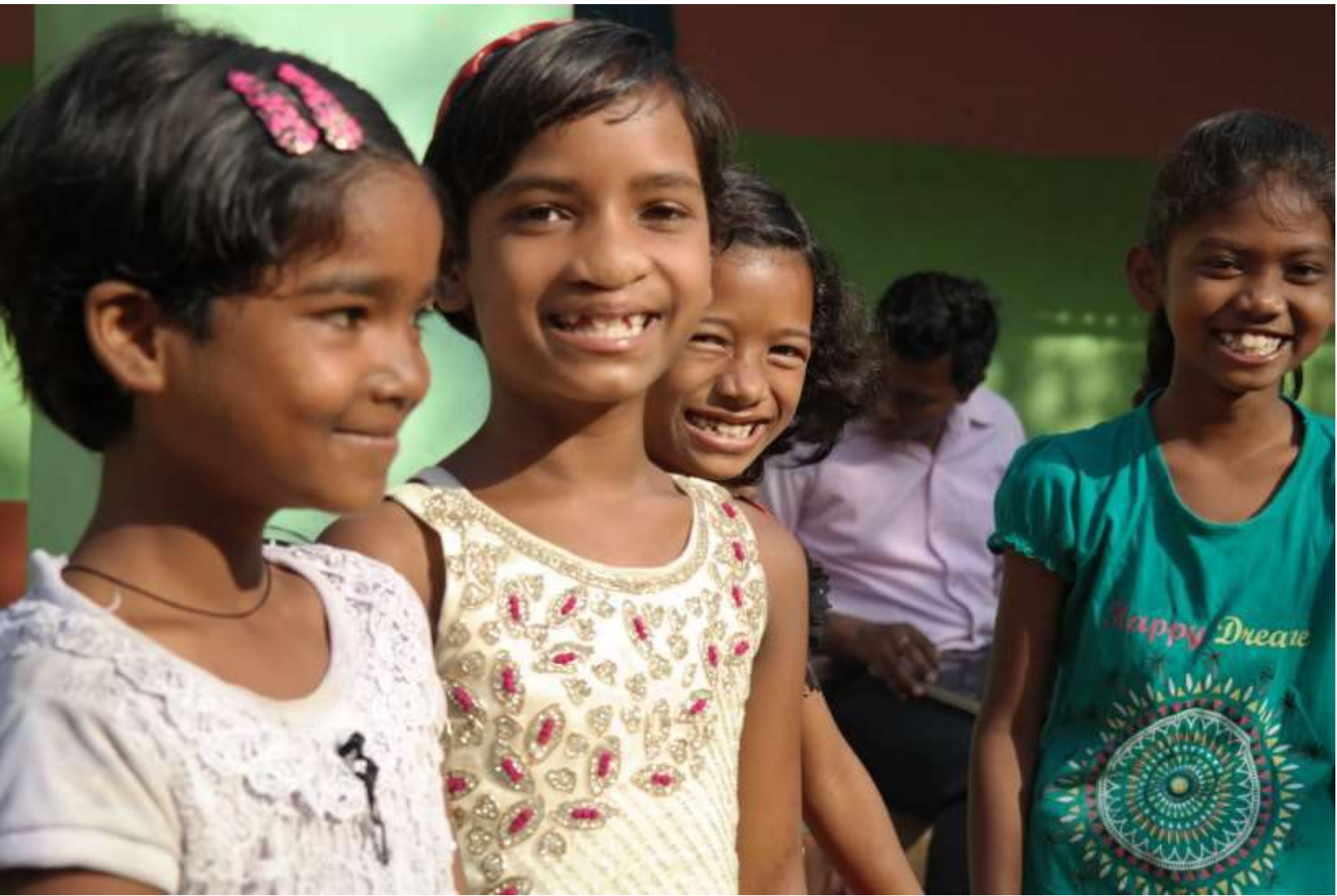
Figure 1- Happy faces of children as we interact with the kids in Prathmik Shala, Goriyan