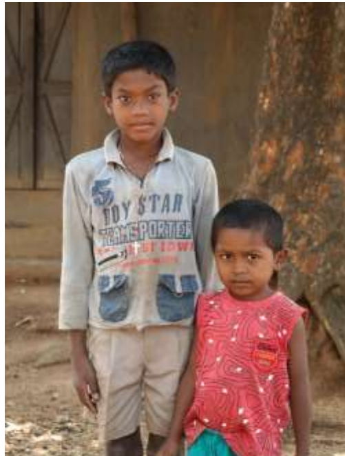
Figure 2- The admission procedure was a delight as we interacted with individual kids at their home.

It's obvious to conclude that Jokhbala is a remote settlement of tribal groups staying together, helping each of their own to exist in the society. They lack basic elements of survival like electricity, water, and proper houses to stay in especially during summer due to lack or delay in monsoon rain people in this vicinity have to go without water for days till shower hits the land. Moreover, major occupation here is farming as every family has 2 or 3 cultivable lands through which each family is surviving. Lack of water leads to starvation for days in families. Even the monsoon time is not safe for the people. As per studies, the land consists of a lot of metal such as gold underneath and therefore every 50 - 60 people on an average die due to lightning.